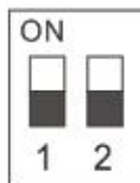
Normal Mode [OFF/OFF]

There have 2 mode switch in the inner of the product, it can form 4 kinds of different ways through these 2 switches, it can realize 4 kinds of different functions as below: